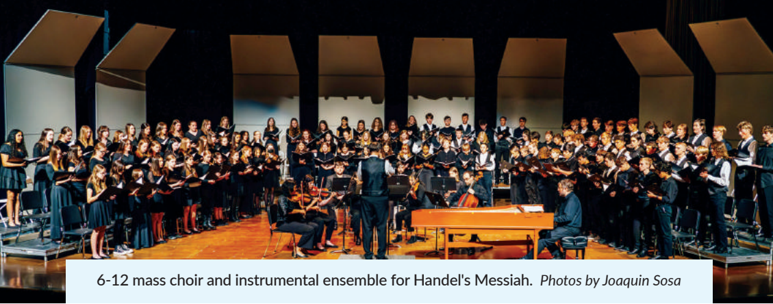
6-12 mass choir and instrumental ensemble for Handel's Messiah.