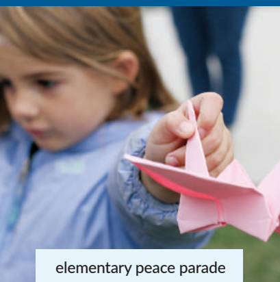
elementary peace parade