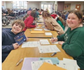
students write to supporters

As of January 29, 445 supporters gave 488 gifts totaling $156,022 for the Christmas Fund Drive this year. Thank you for responding when students, faculty, or staff reached out by mail, phone and personal contact! Our goal is for students to share their EMS experience, learn communications skills, and build connections with our alumni and supporters.