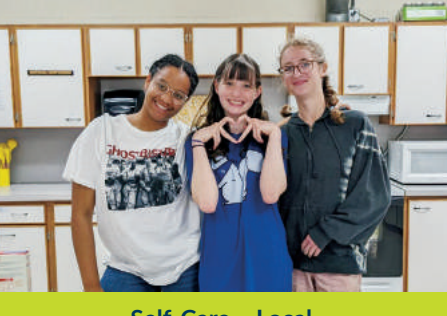
Self-Care - Local